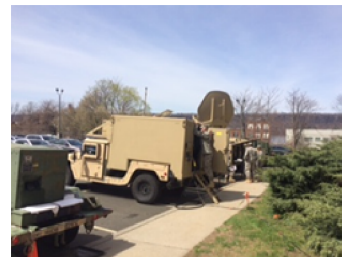
WIN-T Systems Setup at Yonkers Armory 19 April 2015