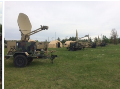
B Co employs WIN-T equipment during Mini-Signal Exercise 15 May 2015